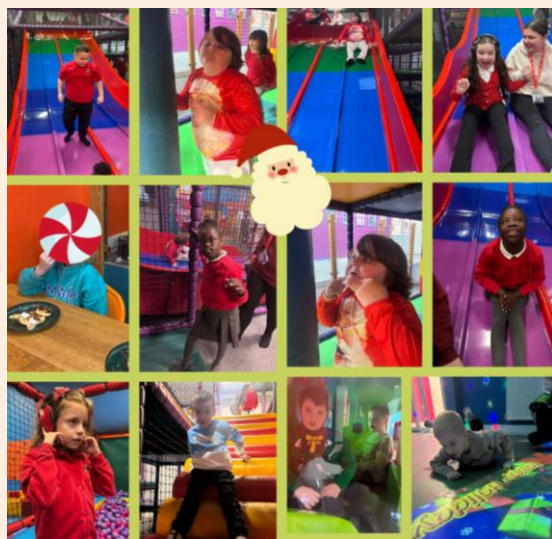
Class 9 had so much fun playing at The Play Yard.

This year's Christmas Concert, The Greatest Snowman, was a magical and heart-warming performance.