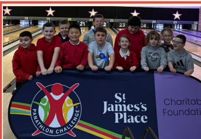
Key Stage 2 pupils enjoyed participating in the Panathlon Challenge Ten Pin Bowling Competition at the Red Dragon Centre in Cardiff Bay.

As we look ahead to next term, we are excited to continue building on the skills we have developed this term. Pupils should keep an eye out for our Enterprise Project, which promises to be another fantastic opportunity for creativity, teamwork, and independent thinking.