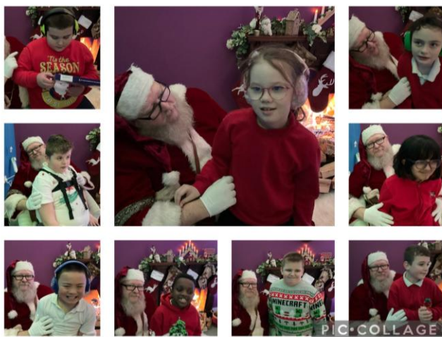
Class 10 loved their visit to Santa at The Play Yard.

Back at school, we have been very busy preparing for the Christmas Fete. Pupils worked hard to create special items for our Christmas Eve boxes, showing great creativity and teamwork. Alongside this, we have completed lots of festive crafts, from decorations to cards, helping everyone get into the Christmas spirit. Overall, it has been a joyful and creative term, filled with excitement, celebration, and plenty of holiday cheer.