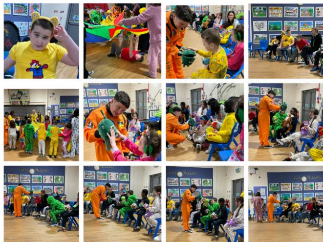
Key Stage 2 participating in the interactive story with Looby Lous!

This Autumn Term has been an exciting and action-packed journey for our Key Stage, filled with creativity, exploration, and hands-on learning. Our topic, Robot Rampage , has captured pupils' imaginations and given them the opportunity to dive into the fascinating world of robots, machines, and materials in a variety of fun and engaging ways.